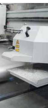
special processing in a dished end