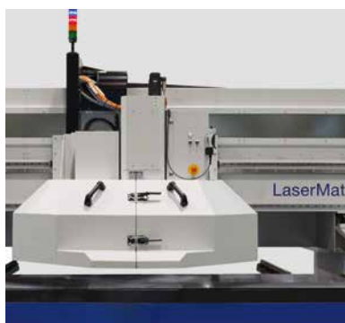
The laser on-board protection hood together with the light barriers allow direct crane loading as well as loading and unloading during the cutting operation