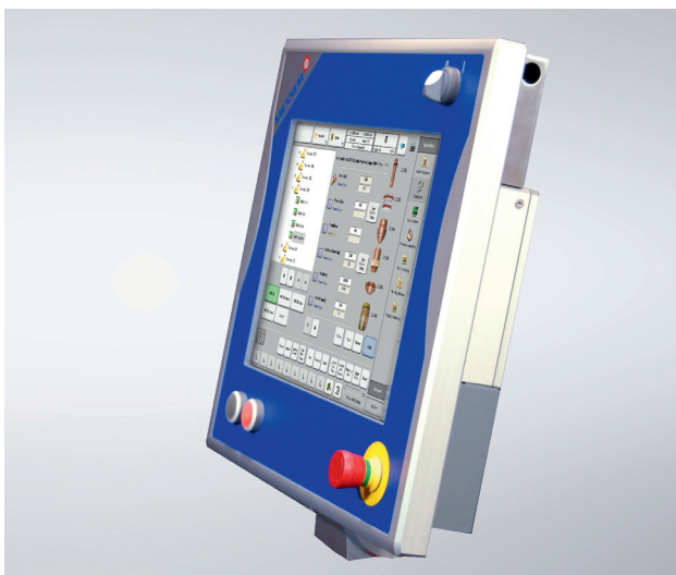
Hardened switches and industrial touchscreen

Our exclusive CNC control includes expertise gained from thousands of machine installations around the world. An extensive custom shape library, multiple process databases, CAD import, true-shape nesting, productivity monitoring and remote diagnostics are just some of the key features packaged in the industry's only IP65 rated enclosure. Easy to learn functions allow for a quick familiarisation for new employees to achieve expert results.