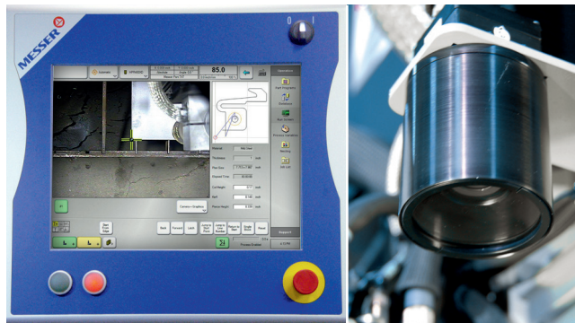
Video camera featured above (right) allows for fast, accurate plate alignment.