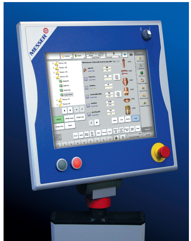
High strength machined aluminium enclosure